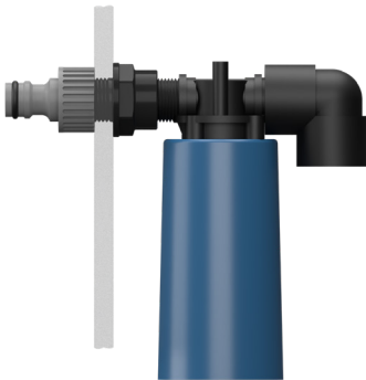
Installed to the tank's inside wall

The Industrial Water Valve is suitable to connect with quick release. Ideal for use in scrubber machines. Its size and advantages allow the designer to freely develop tank shapes which are not possible with other standard float and lever operating valve such as in scrubber machines.