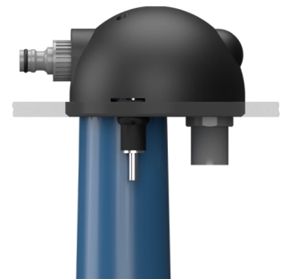
Replaces the tank's lid